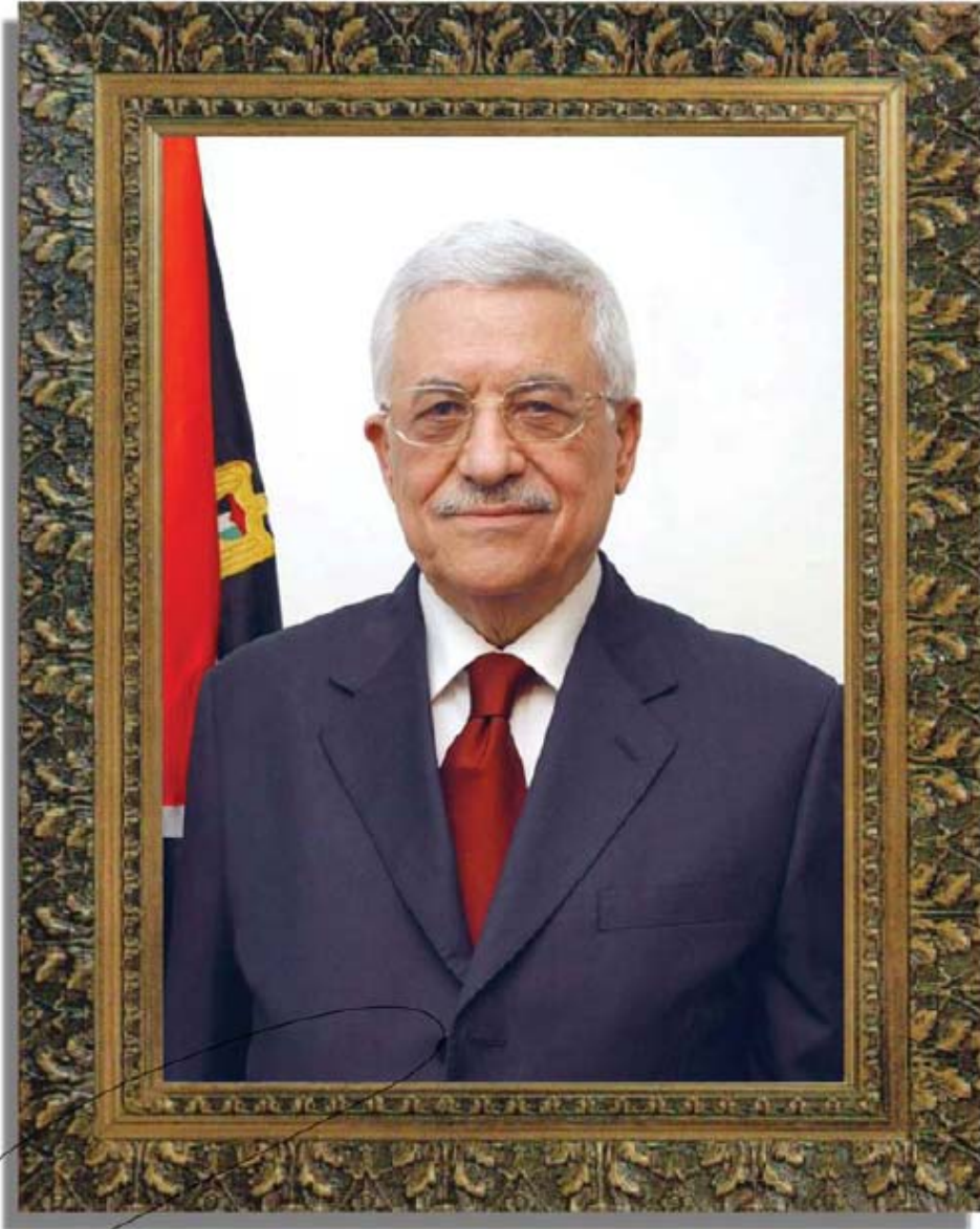
فخامة الرئيس محمود عباس "أبو مازن" رئيس اللجنة التنفيذية لمنظمة التحرير الفلسطينية رئيس السلطة الوطنية الفلسطينية